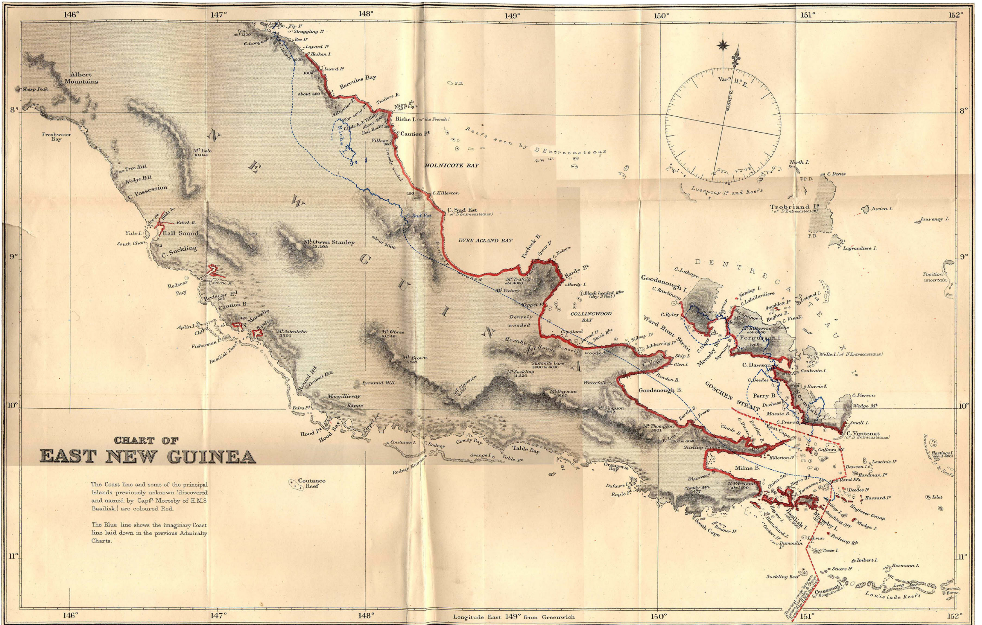
CHART OF EAST NEW GUINEA

The Coast line and some of the principal Islands previously unknown (discovered and named by Capt. Moresby of H.M.S. Basilisk.) are coloured Red.