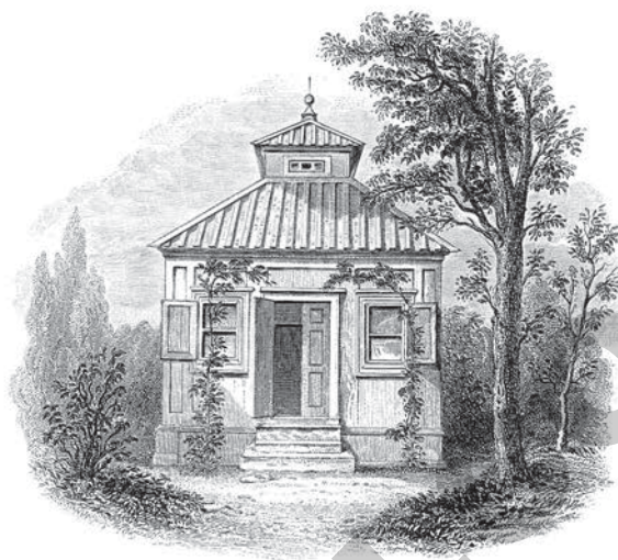
Swedenborg's Summer House.